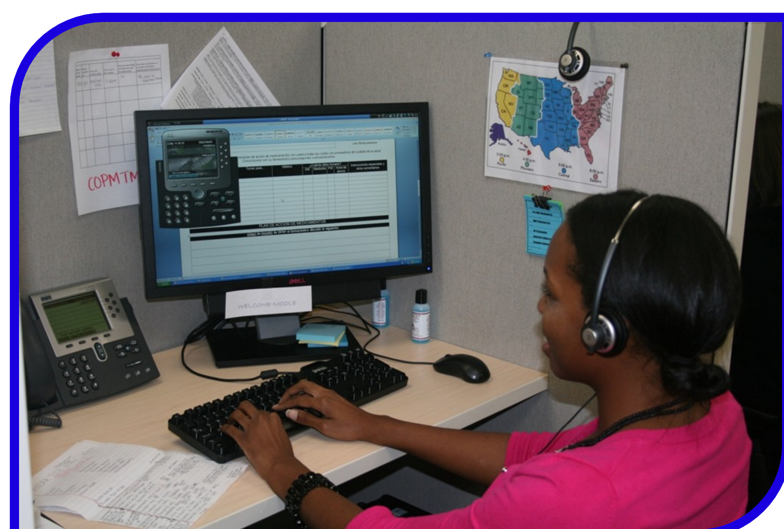
Student Providing MTM